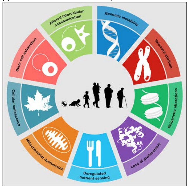
Figure 1. The nine “hallmarks” of aging (from Cell 2013 June 153(6): 1194–1217).

A number of “hallmarks” of aging (Figure 1) that collectively define the aging phenotype have been identified. Geroscience is a newly described concept relating these key mechanisms of aging to the development of chronic disease, functional decline and disability limiting healthy years of life. The focus of this RFA is to use the concept of geroscience, and its interaction with HIV infection, to identify mechanisms that lead to chronic disease and premature multi-morbidity, functional decline and geriatric syndromes (e.g., falls, frailty) in people living and aging with HIV (Figure 2). Only those applications that are focused on the aspects of the biology of aging that contribute to chronic diseases and the hallmarks of aging that drive the aging process within the context of HIV will be considered for funding.